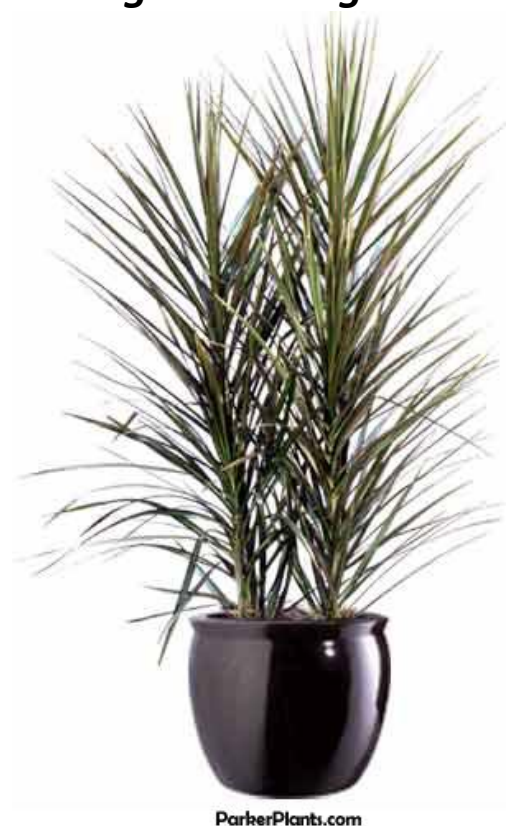
Previously known as Dracaena marginata. Also available: upright tree form, single-trunk tree form, and a bush form.