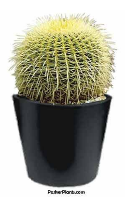
There are numerous forms of barrel-shaped cactus.