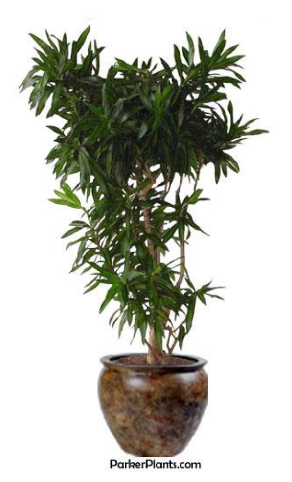
Previously known as Pleomele reflexa