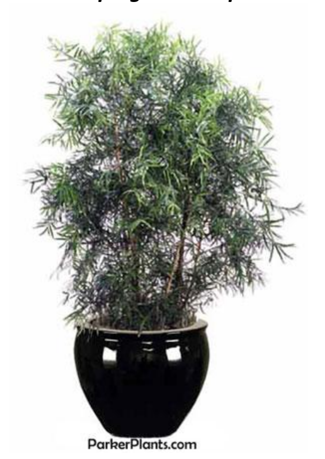
Previously called Podocarpus gracilior. Also available as single trunk standards.