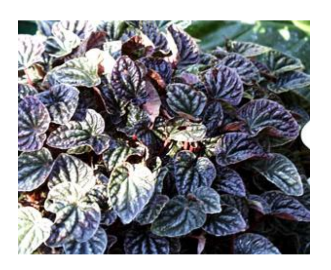
Peperomia obtusifolia Oval Leaf