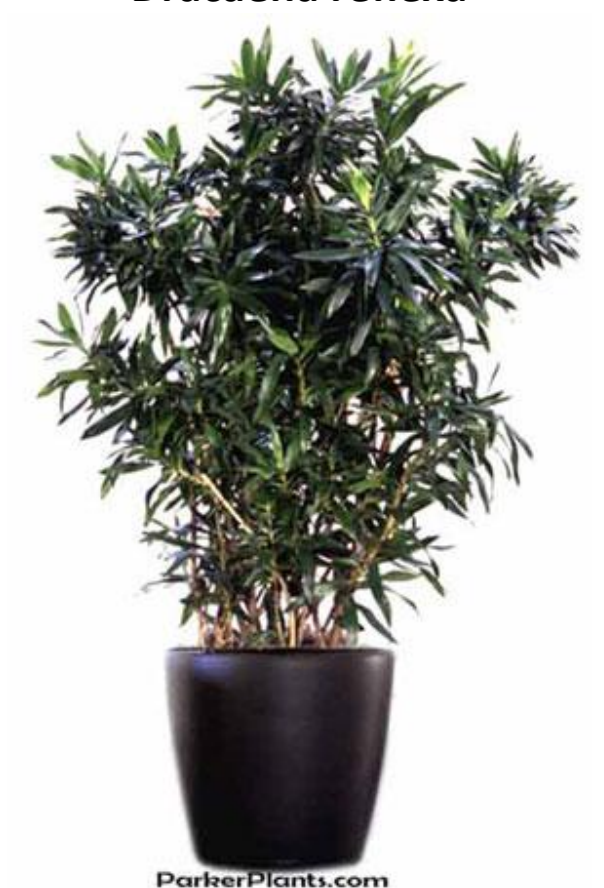
Previously called Pleomele reflexa. Also available in a bush form and a single or multitrunk tree form.