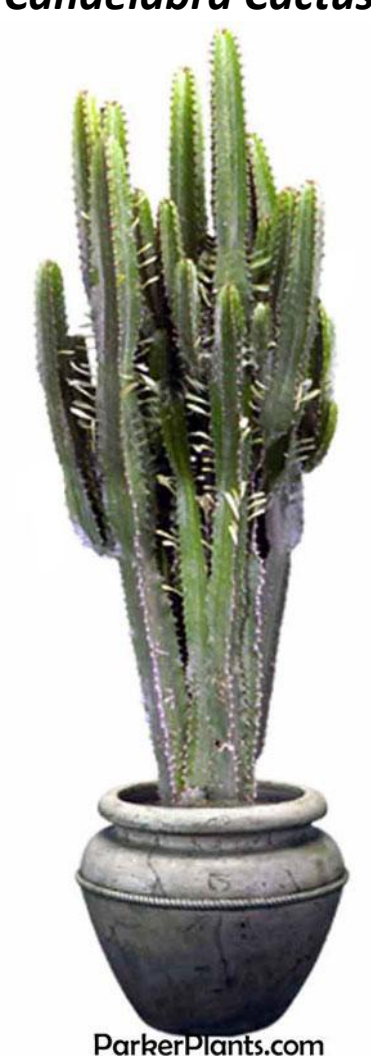
LIGHT REQUIREMENTS: High light