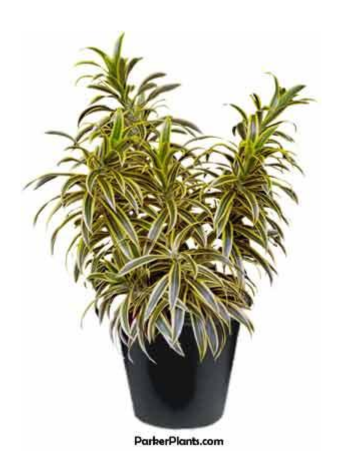
Previously called Pleomele reflexa LIGHT REQUIREMENTS: Medium light to high light MOISTURE REQUIREMENTS: Dry side