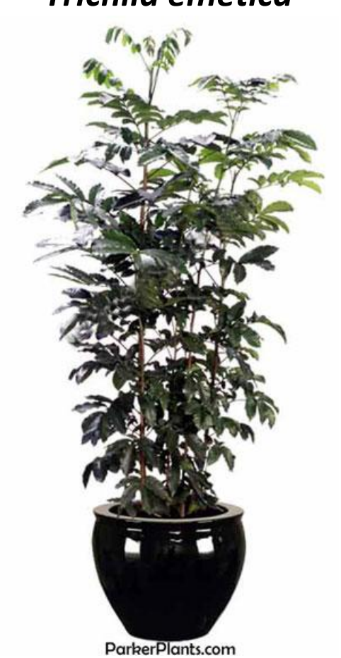
LIGHT REQUIREMENTS: Medium light to high light MOISTURE REQUIREMENTS: